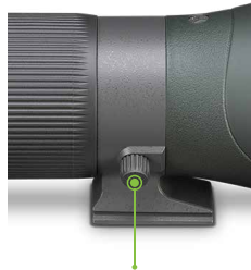
Mounting Collar Thumb Screw